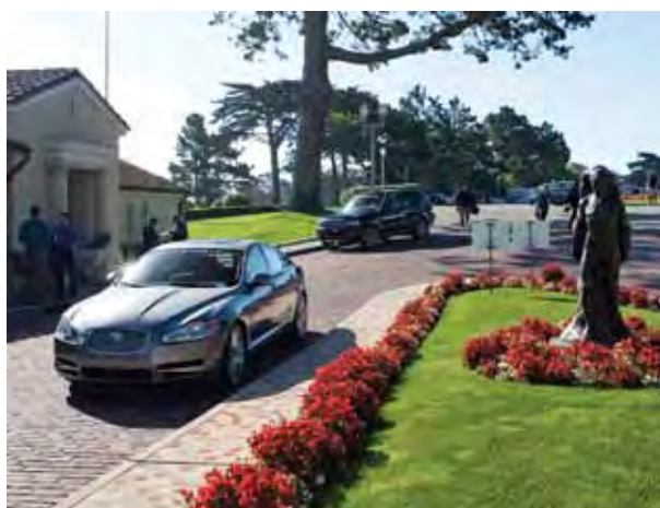
British Motors of SF provides luxurious vehicles for the hole-in-one and closest-to-the-hole contests.