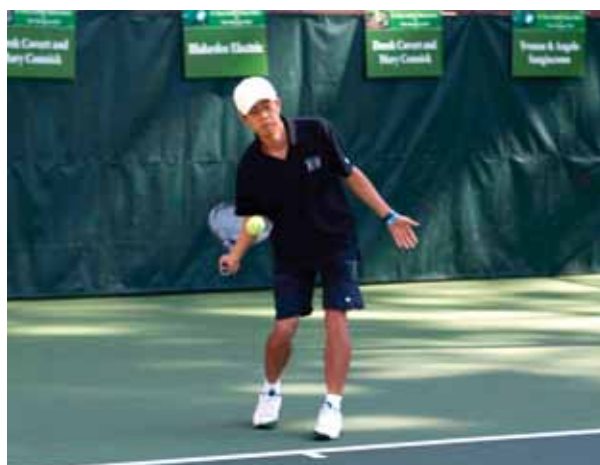
Beautiful weather was the backdrop for the round robin tennis tournament.