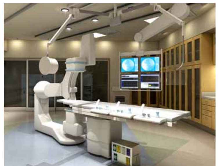
Multi-surgical teams will utilize this advanced Vascular Suite

the completion of the new Vascular Suite, we will be able to offer our patients the best chance of reclaiming their lives from cardiovascular and peripheral vascular disease.