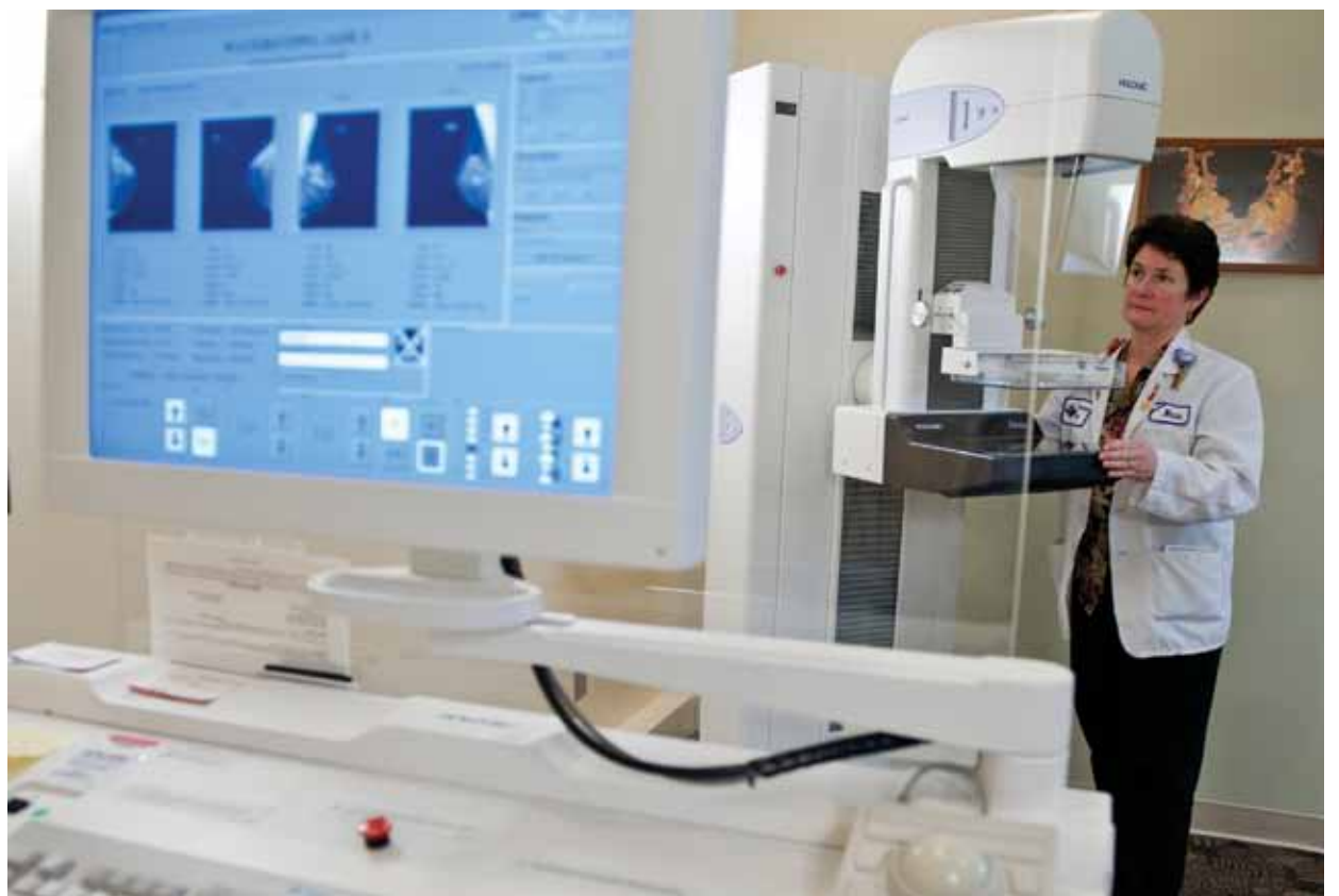
Latest digital mammography equipment

Digital mammography has become the new standard of care, producing clearer images than traditional analog equipment. The high-resolution images