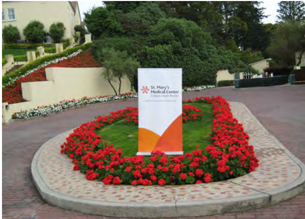
The Olympic Club