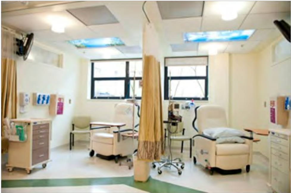
New linear accelerator in the Cancer Center

The majority of capital transfers fulfilled the $4.5M for the Cancer Center and half of the Center for Women’s Health. (Phase 1 of the Vascular Suite was installed, but funding will be recorded in FY 2013 for the completion of the Women’s Health Center and Vascular Suite.) •Over $400,000 to provide medical care to the sick and needy •$85,000 for medical residency education •$27,000 for adolescents and children •$18,000 for speech therapy equipment •$11,000 to fund education for medical professionals •$ 4,000 for ophthalmology equipment for the Sr. Mary Philippa Clinic •$ 4,000 for cardiac rehab equipment