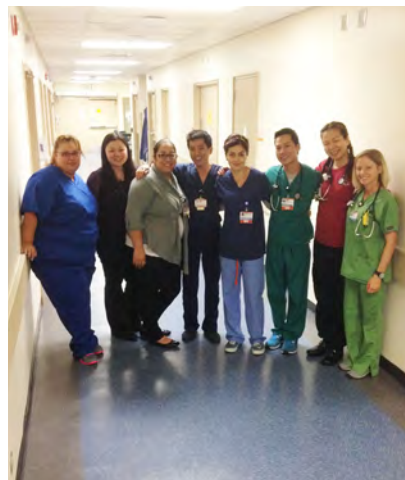
After the "floor-lift" with ER Staff

floors looked worn, now the floors look great and we have received great feedback from visitors.