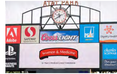
"Women & Medicine" warmly welcomed on the score board